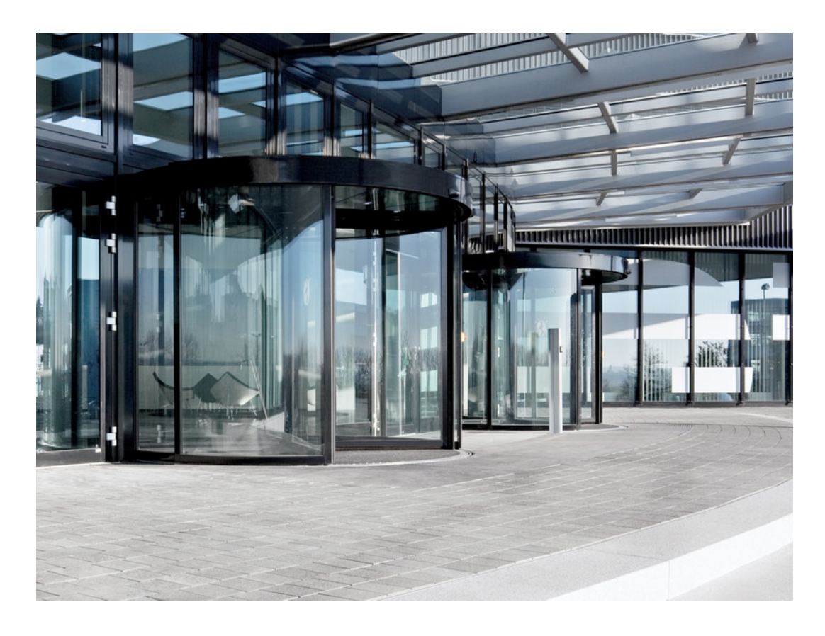
Automatic revolving door system for escape and rescue routes with break-out function